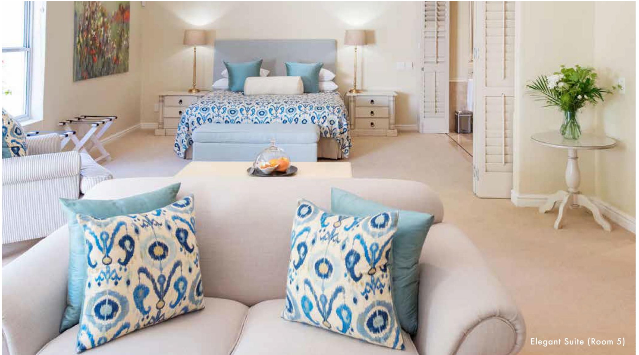
Elegant Suite (Room 5)