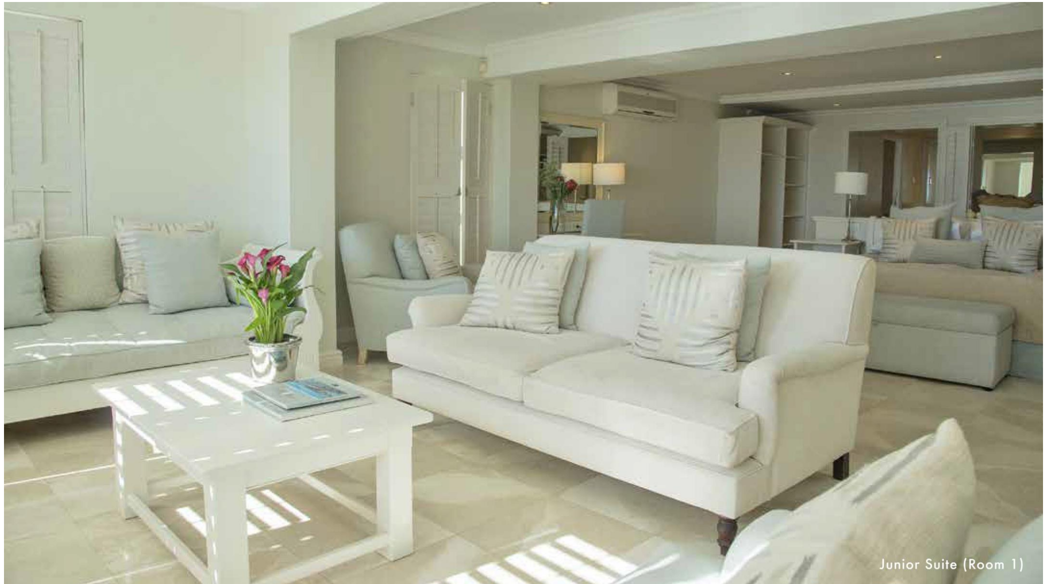
Junior Suite (Room 1)