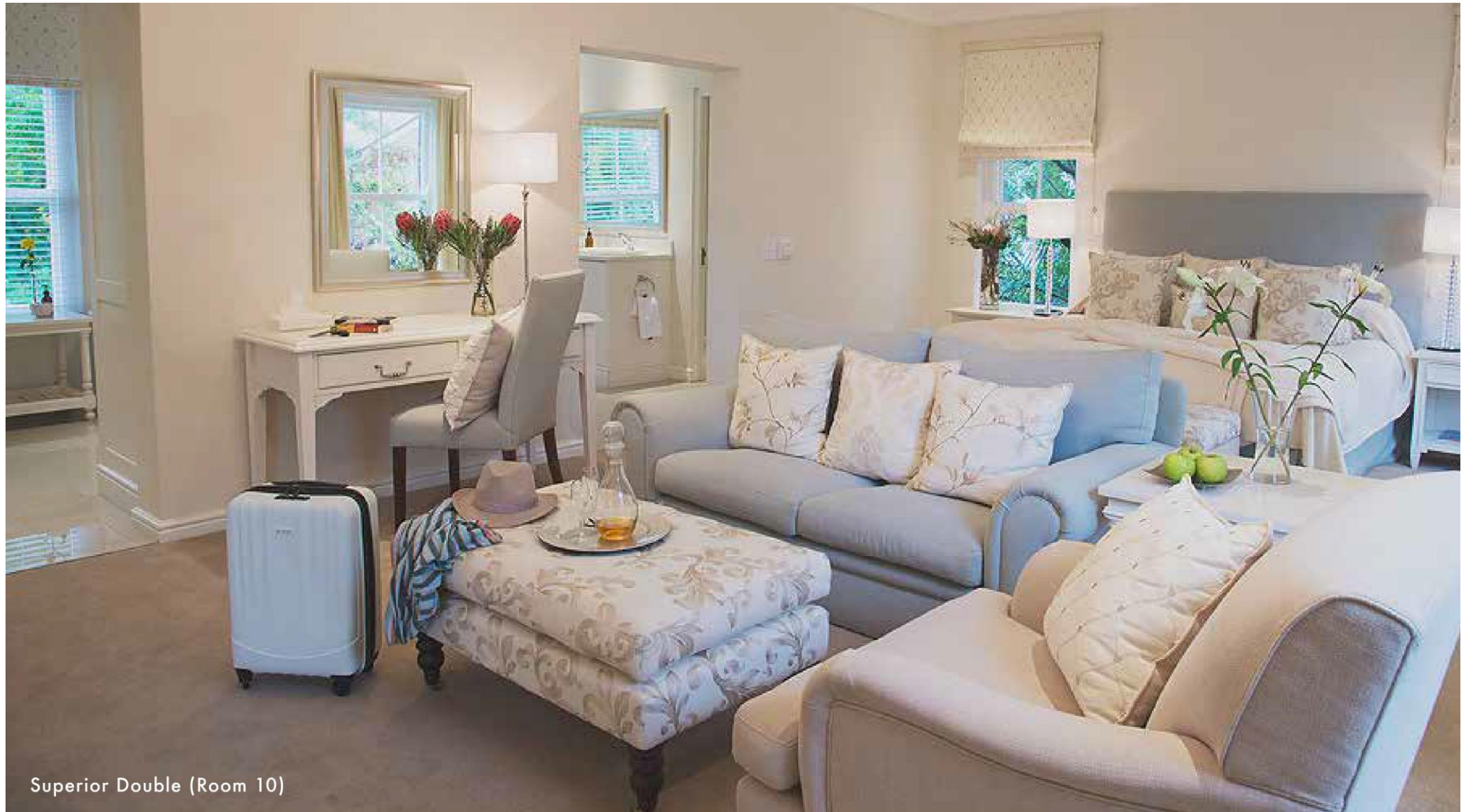
Superior Double (Room 10)