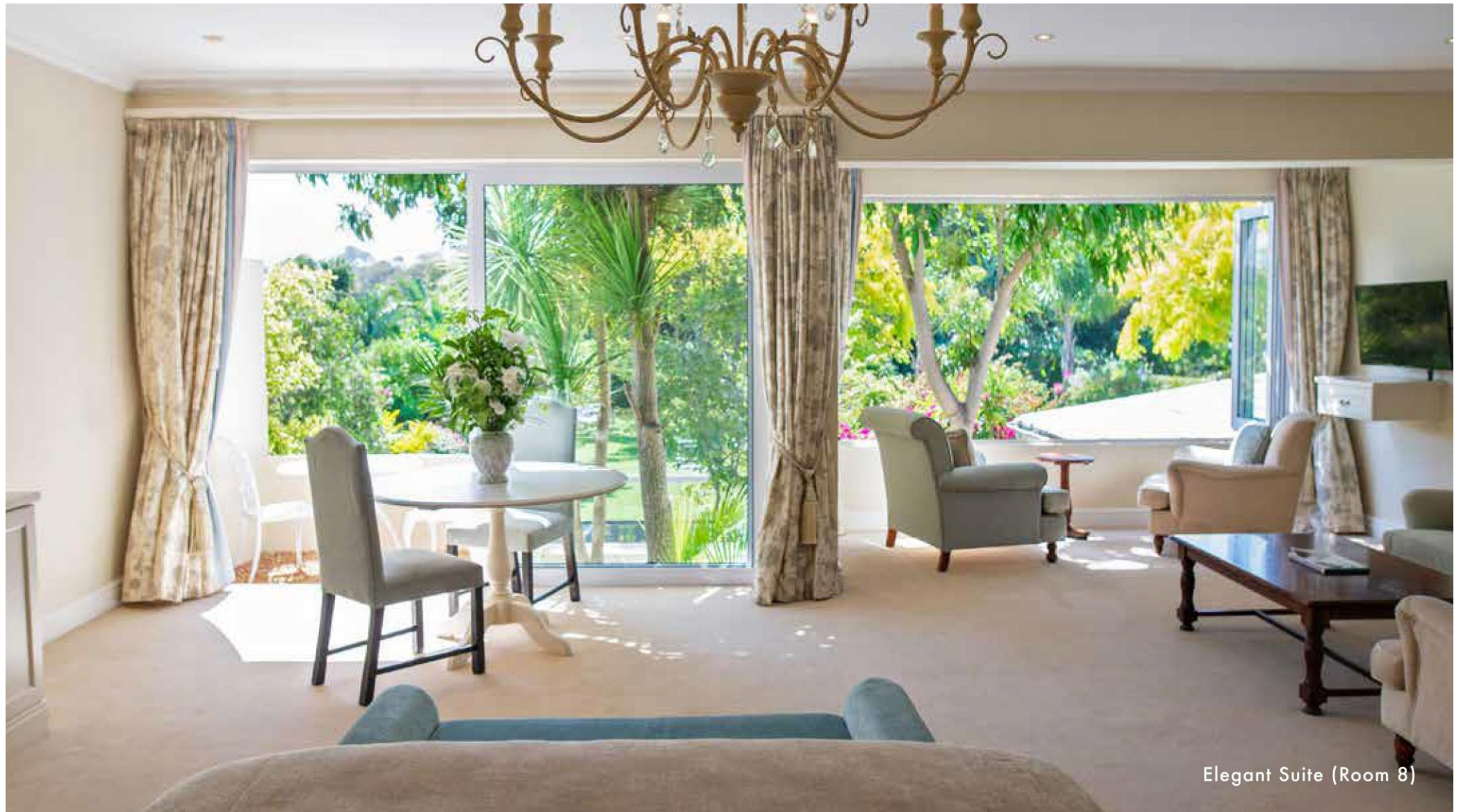
Elegant Suite (Room 8)