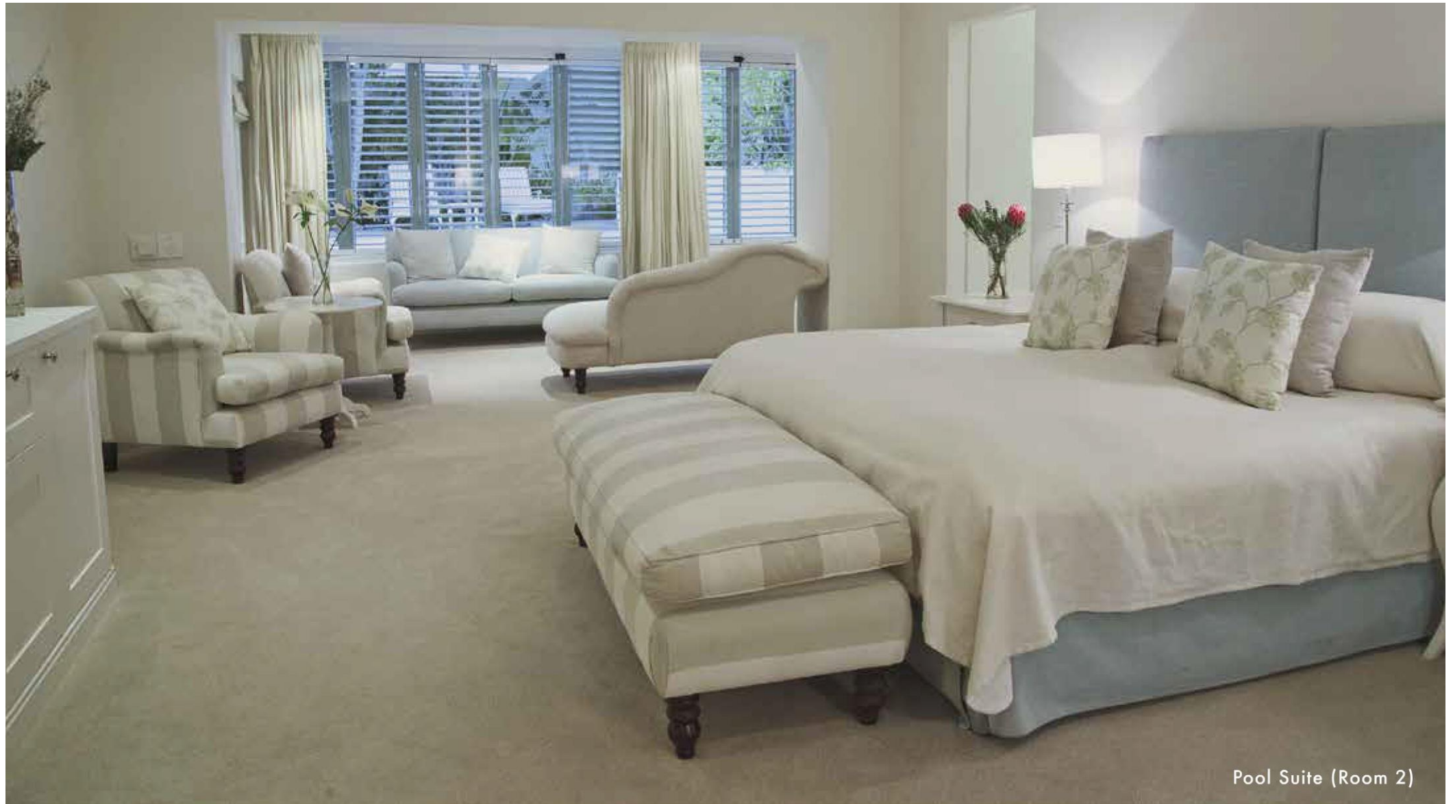
Pool Suite (Room 2)