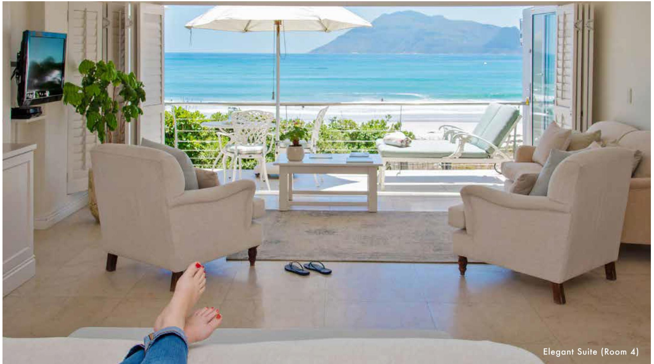
Elegant Suite (Room 4)