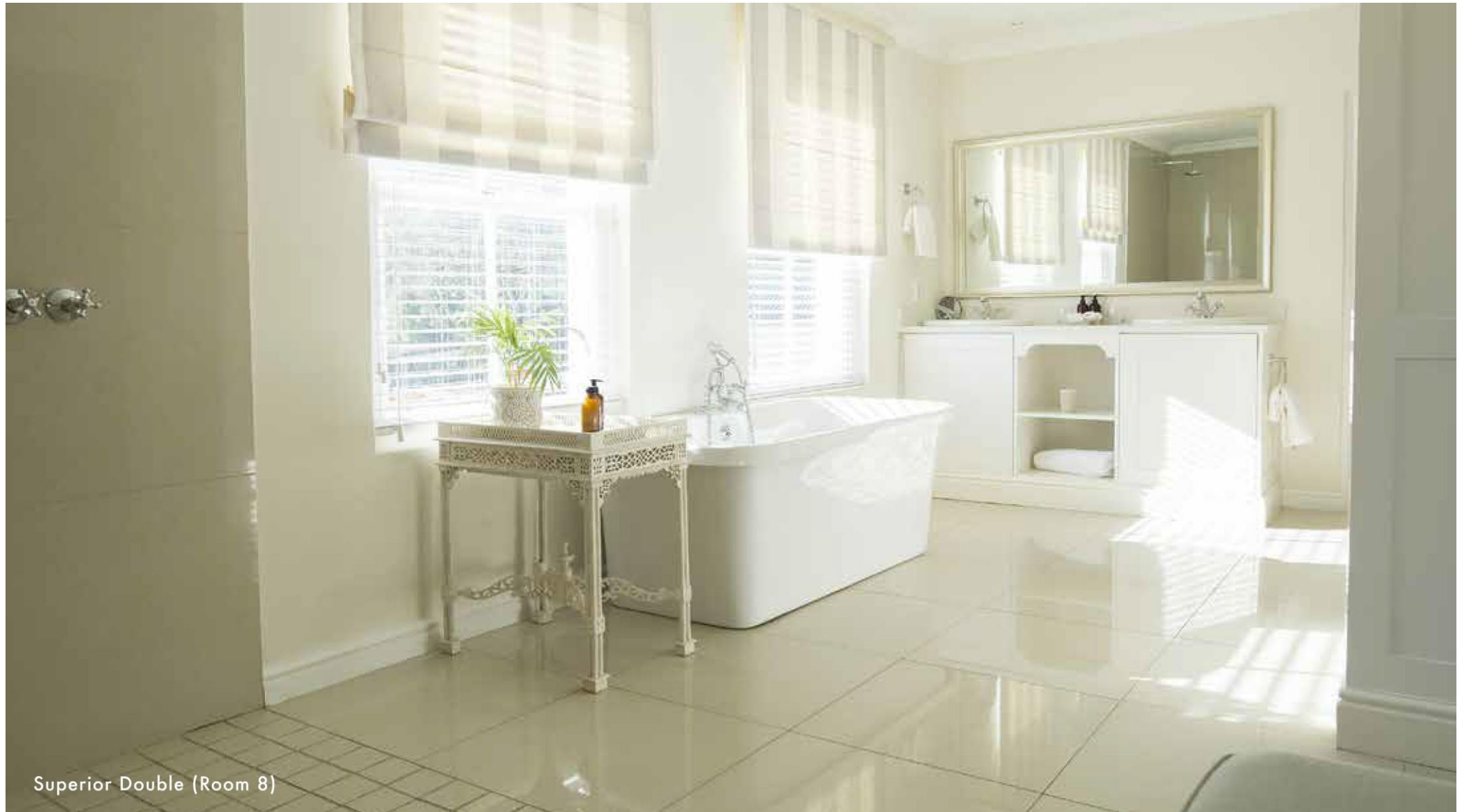
Superior Double (Room 8)