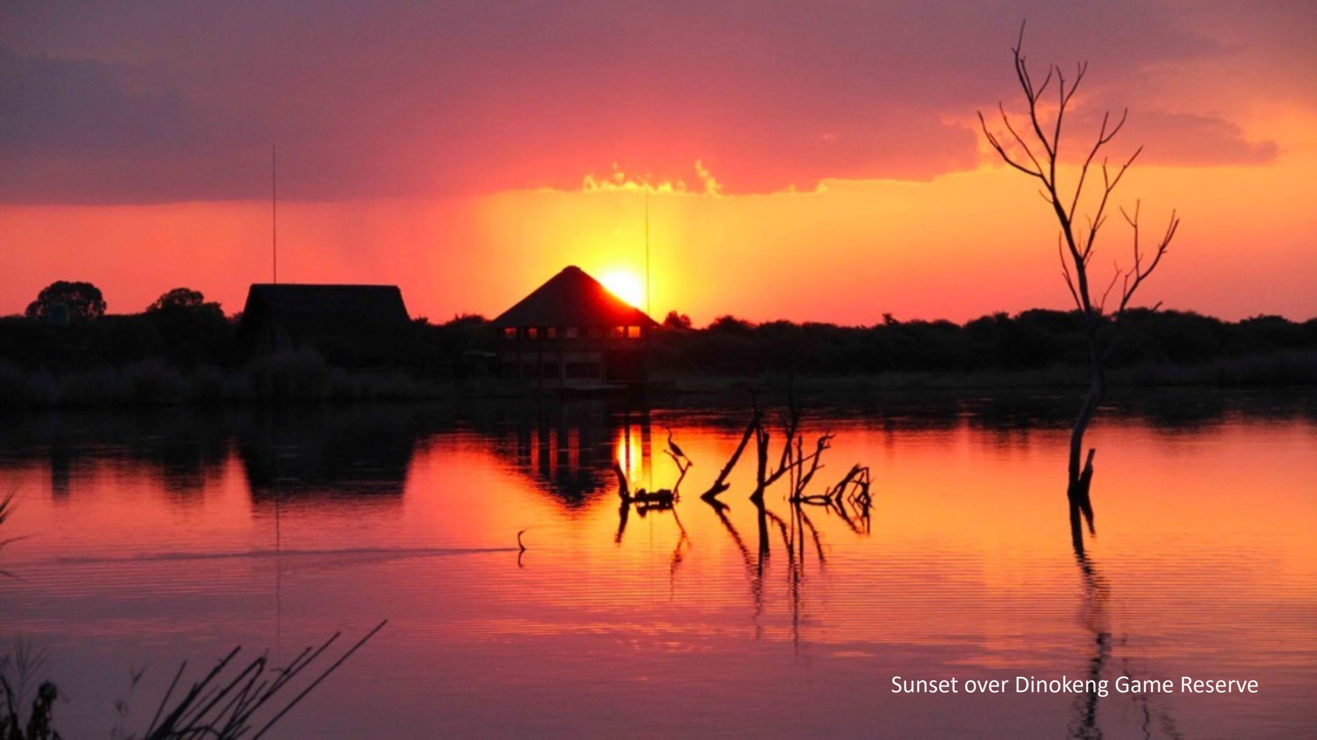
Sunset over Dinokeng Game Reserve