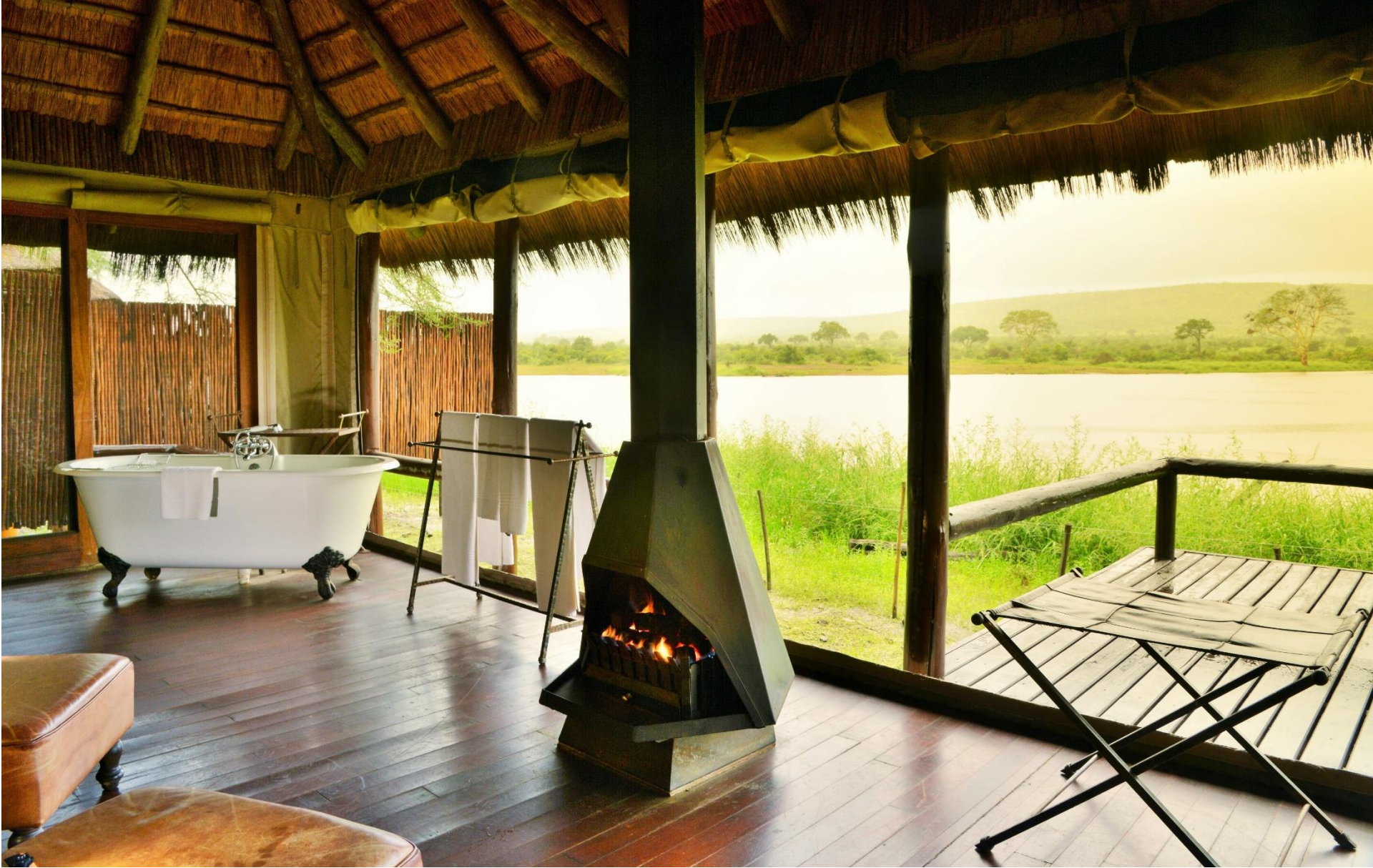
CAMP SHAWU – BATH, OUTDOOR SHOWER AND FIREPLACE