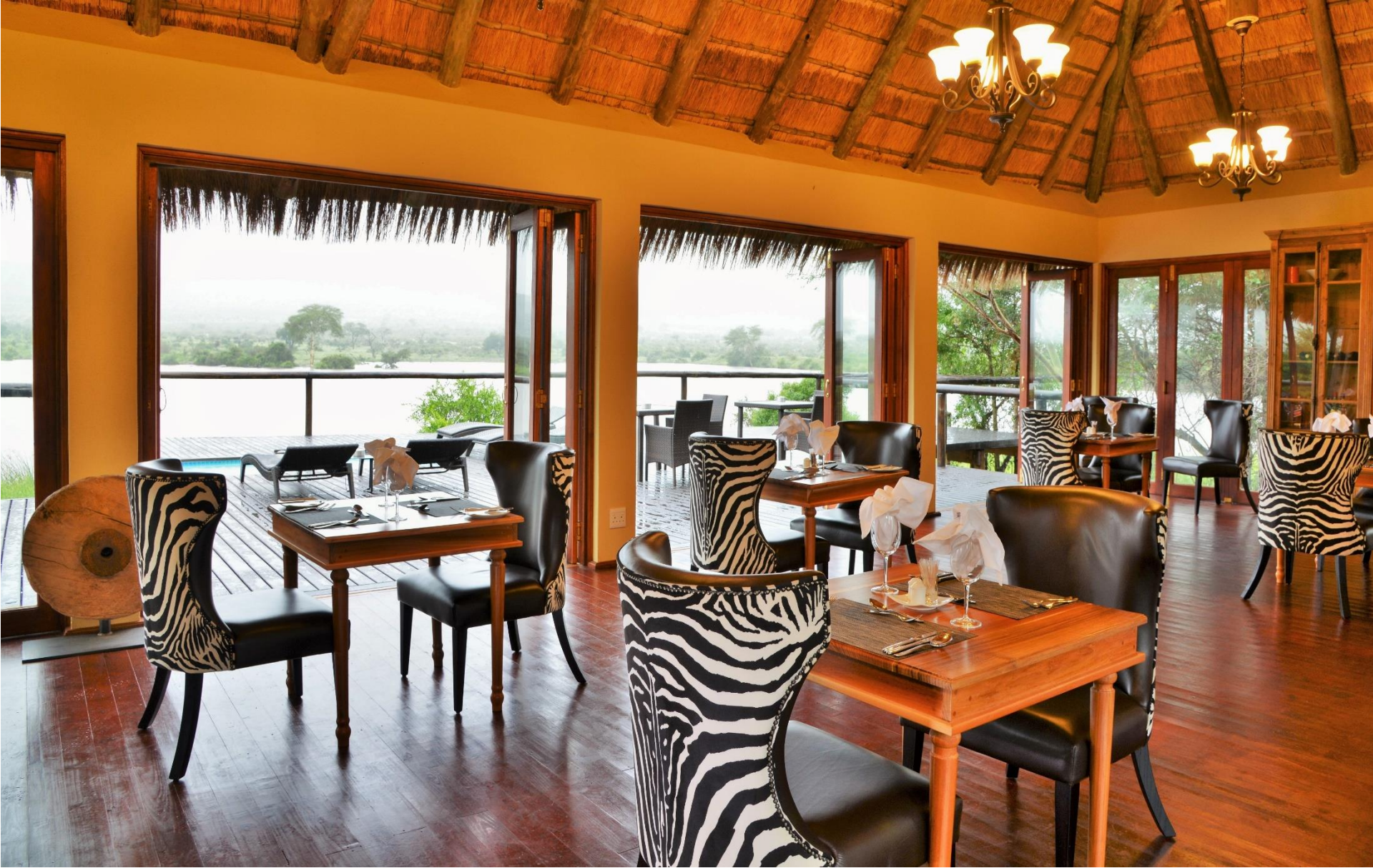
CAMP SHAWU – DINNING AREA