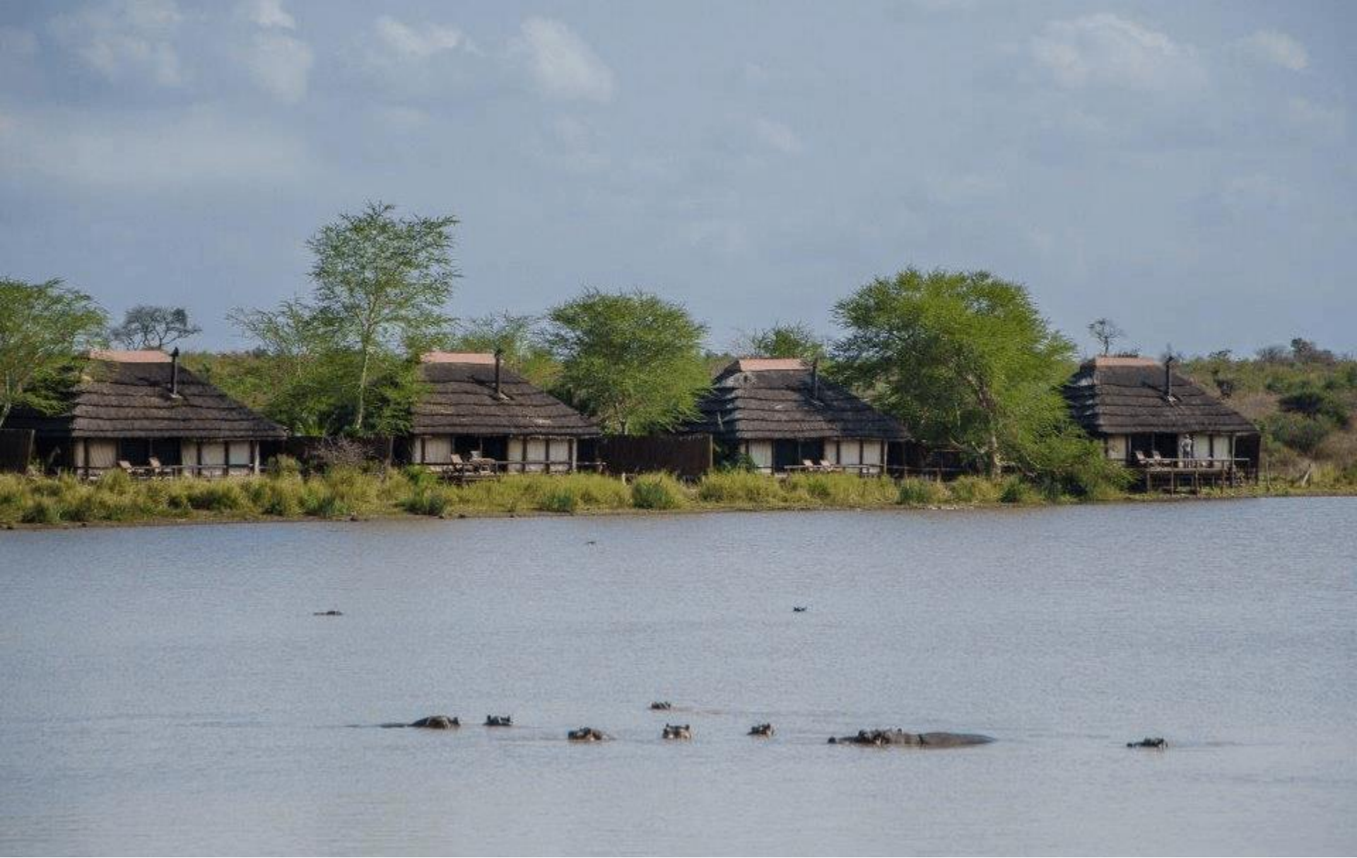
CAMP SHAWU – VIEW OF CAMP SHAWU FROM ACROSS THE DAM