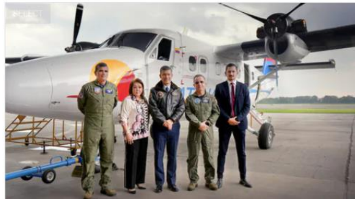
Accessible Travel-Focused Airlines The Global Brand Frontier Awards Recognized SATENA