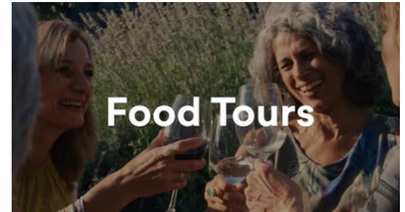
Culinary-Focused Travel Experiences: EF Go Ahead Tours Launches the Food Tours Collection