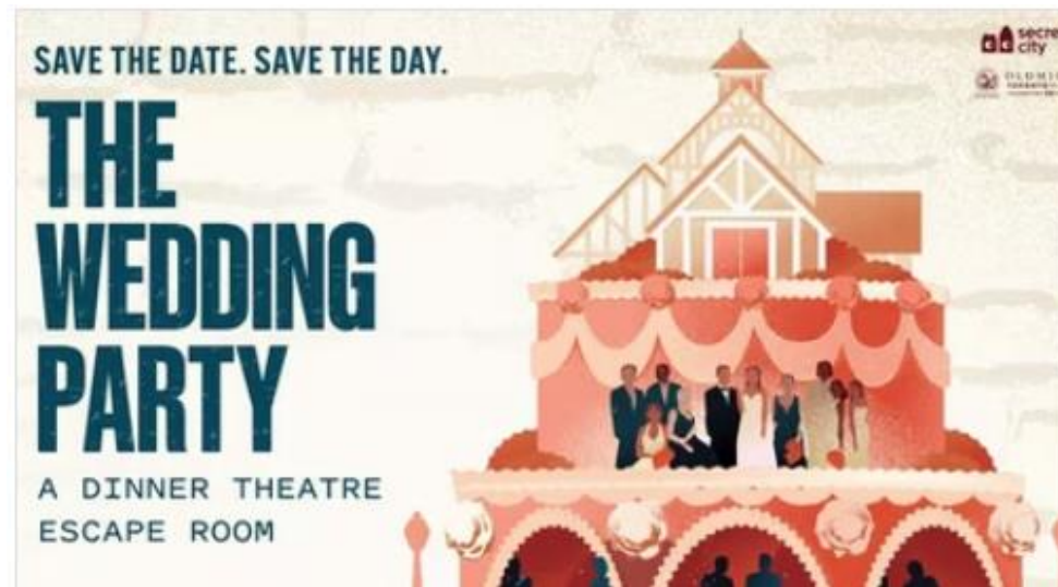
Dinner Escape Rooms The Wedding Party Dinner Theater is a Three-Course Entertainment Event