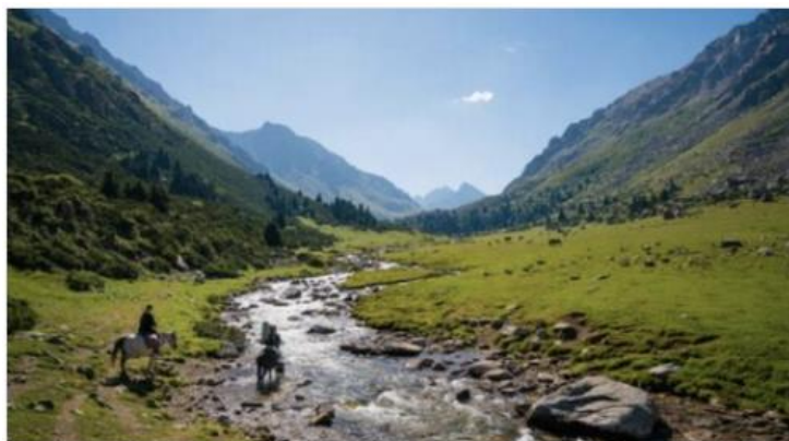
Underrated Travel Locations Intrepid Travel Has Released Its Annual Not Hot List