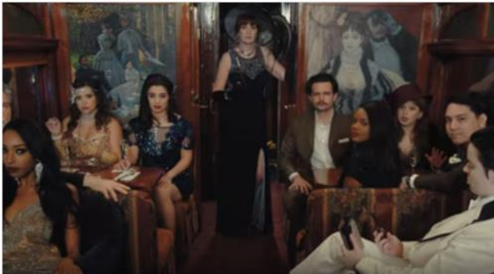
Murder Train Dinner Experiences Napa Valley Wine Train Offers Various Murder Mystery Dinners

Insight: As consumers dine out less frequently, they place greater emphasis on experiences that feel distinctive and worthwhile. Many now approach outings as intentional social occasions rather than routine activities, seeking engagement beyond standard service. Moreover, conventional formats can feel passive and easily replaceable, prompting a shift toward more dynamic environments. Interactive mystery elements respond to this by introducing novelty and memorability.