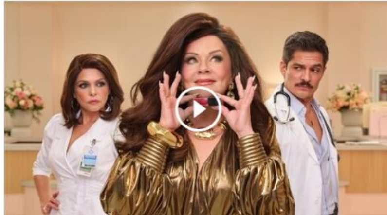
Telenovela-Inspired Beauty Campaigns e.l.f. Cosmetics' Big Game Ad Airs Ahead of Halftime