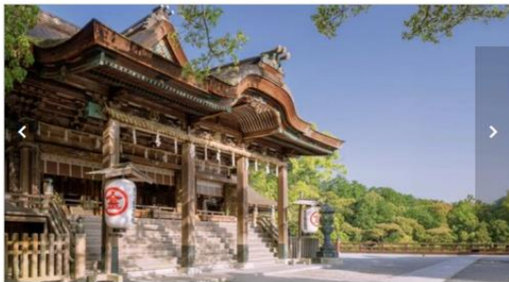
Lesser-Traveled Japan Tours EF Adventures Launches its Japan Multi-Adventure

Insight: In a busy world marked by rising costs and limited time, travellers are still seeking escape, but with a growing desire to avoid tourist traps and engage meaningfully with living cultures. Avoiding the mainstream has become less about signaling status and more about maximising return on time, money, and personal energy. This shift reflects a broader response to the excesses of mass tourism, reframing alternative destinations as intentional choices.