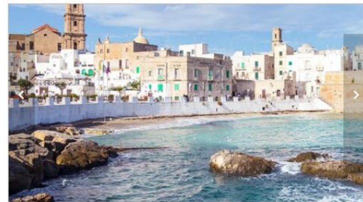
Italian Tour Collections EF Go Ahead Tours Launched 'Made with Amore'