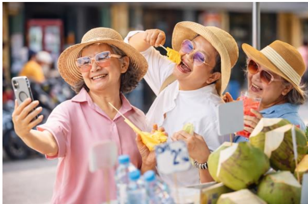
Local-Led Culinary Experiences: Intrepid Offers a Diverse Range of Food Tours for Curious Travelers

Insight: In a world of increasingly standardised experiences, travellers are still seeking exploration, but with a growing desire for deeper cultural connection and meaning. Due to this, dining is no longer just about consumption, but about understanding the context, traditions, and stories behind what's on the plate. This shift reflects a broader move away from surface-level excursions, ultimately reframing food as a gateway to more immersive and intentionally grounded travel.