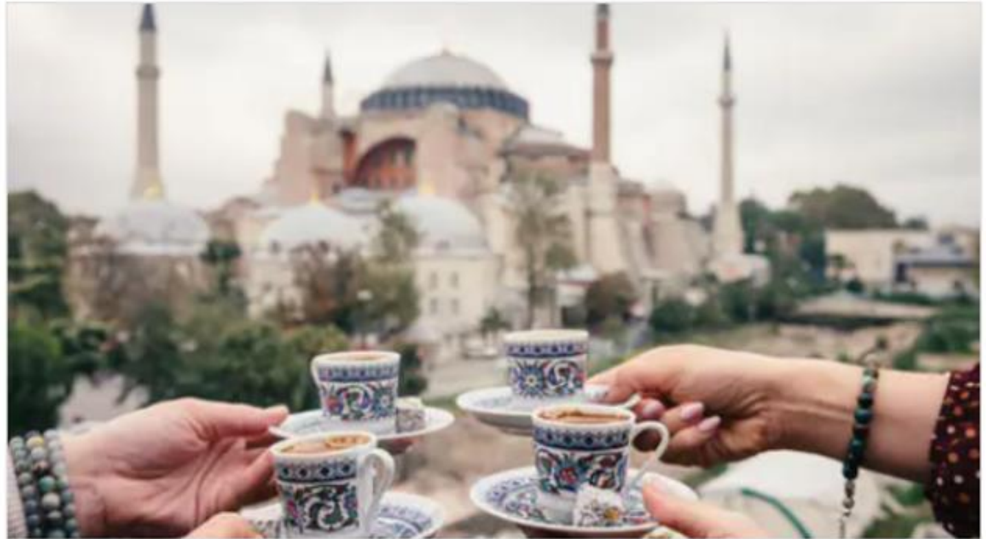
Women's Travel Packages Geographic Expeditions Launched its 'Women of the World Collection'

Insight: As more women influence travel decisions and seek meaningful experiences, demand is growing for journeys that feel intentional and enriching. Female expeditions respond to this by offering deeper cultural engagement and a stronger sense of ease and belonging, moving beyond passive tourism toward more thoughtful travel. As such, this shift reflects a broader preference for experiences that align with personal values and deliver lasting significance.