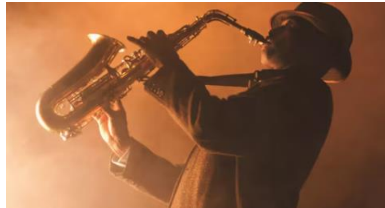
Ten-Day Culture Tours: Trafalgar's Travel Guide Features Curated Music and Cuisine Destinations