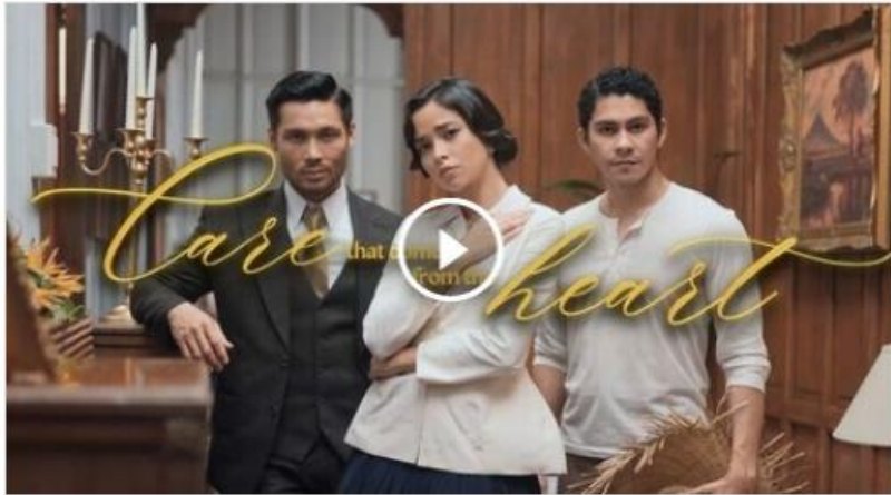
Telenovela-Inspired Safety Videos Philippine Airlines Unveiled 'Care That Comes From The Heart'

Insight: As consumers face increasing advertising and social media fatigue, capturing attention has become more challenging. In response, some brands are incorporating dramatised, entertainment-led storytelling that mirrors how audiences already consume content, as serialised narratives create emotional hooks and continuity; making products feel embedded in everyday life rather than disruptive advertisements, as characters and integral components to a story in ways that feel memorable and aligned with contemporary viewing behaviours.